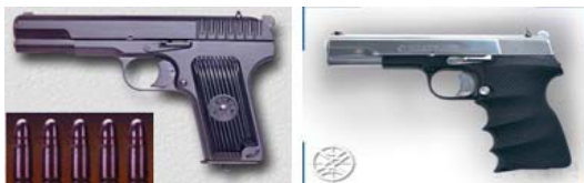
54 type handgun. 51 style 7.62mm bullets Velocity: 420-450m/s