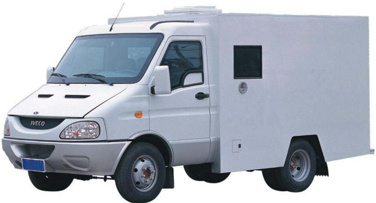
KHCK5043XYCK1 (Euro III)