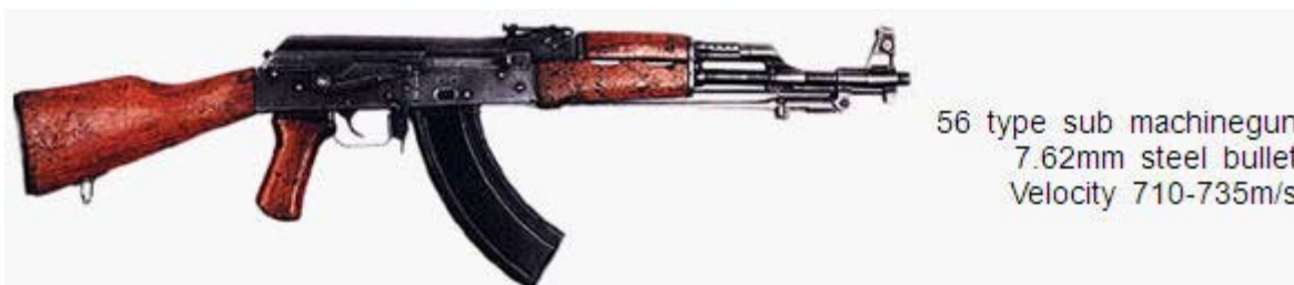
56 type sub machinegun 7.62mm steel bullet Velocity 710-735m/s