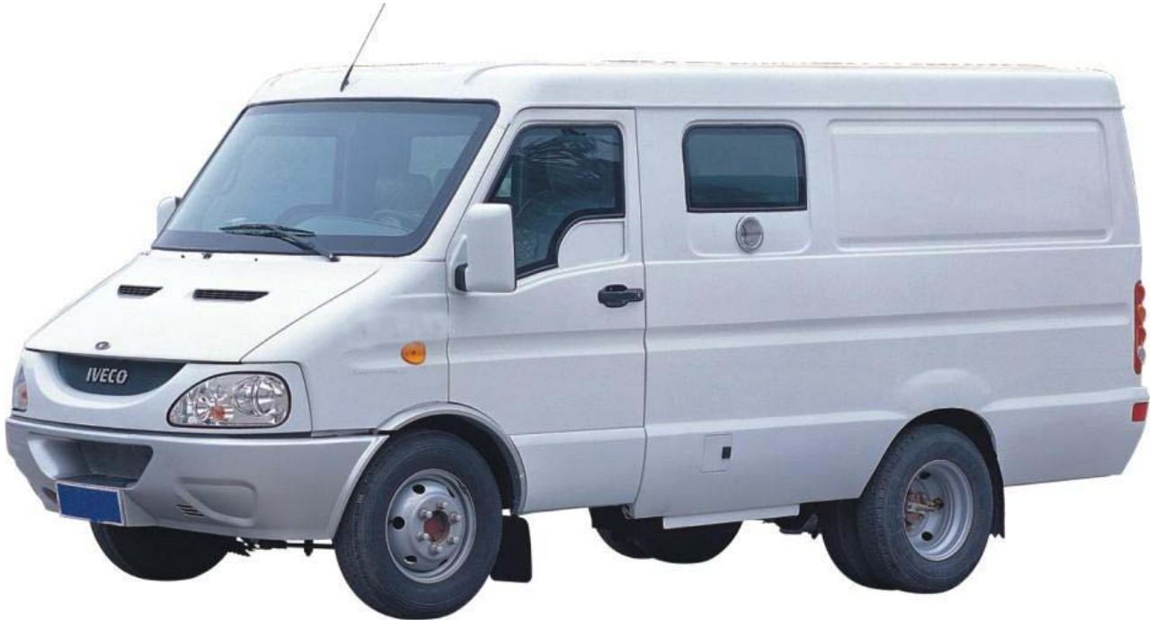
KHCK5042XYCK1 (Euro III)